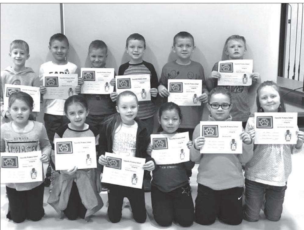
Cassville Primary School recently awarded their Character Kids for the month of December. During the month of December, teachers nominated students for exhibiting the character trait of integrity.