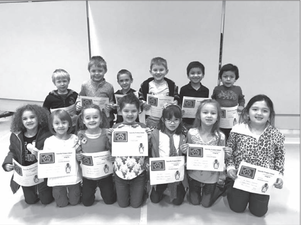
Cassville Primary School recently awarded their Character Kids for the month of December. During the month of December, teachers nominated students for exhibiting the character trait of integrity.