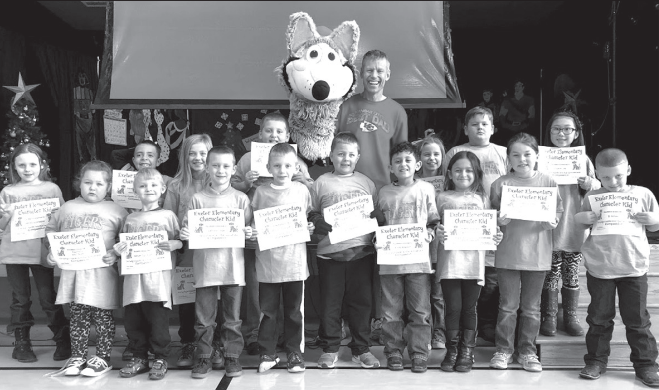
Exeter Elementary recently awarded the December Character Kids awards. December’s assembly featured guest speaker KC Wolf who presented a program on the A-B-C of Success which stresses the importance of your attitude, behavior and character.