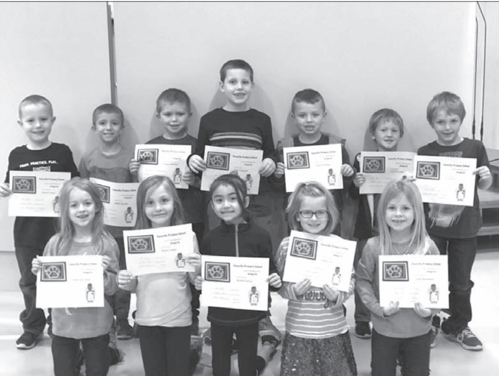
Cassville Primary School recently awarded their Character Kids for the month of December. During the month of December, teachers nominated students for exhibiting the character trait of integrity.