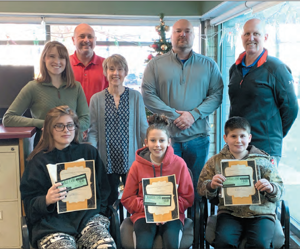
Cassville Middle School recently announced the Students of the Month for December 2019. Students are nominated by CMS teachers and coaches based upon academic excellence, perseverance or improvement, displaying exemplary citizenship and are a positive influence on school culture.