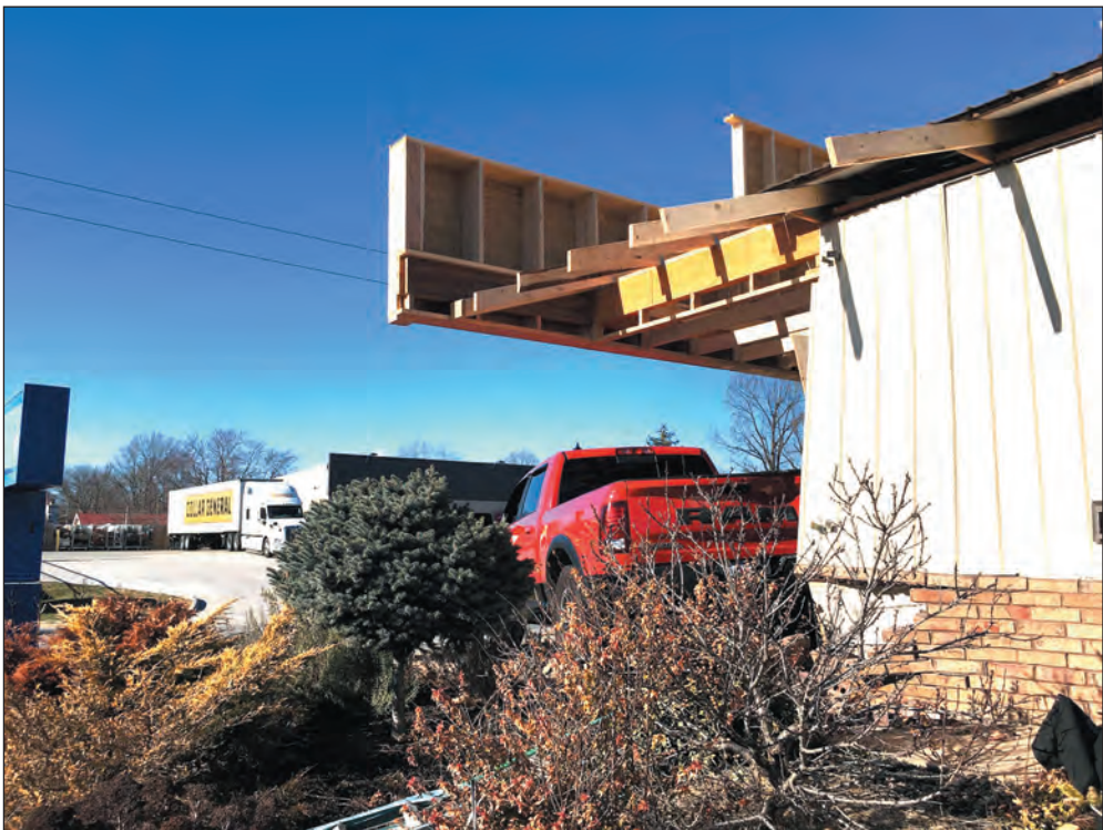
A truck struck the southwest corner of Roark Family Health on Tuesday, December 31, when the driver's foot got stuck between the pedals, resulting to damage to both the exterior and interior of the office of the clinic.

For any further questions regarding the merger and its potential effects on customers, contact Freedom Bank's main branch in Cassville at (417) 846-1719 or Community National Bank's main location, in Monett at (417) 235-2265.