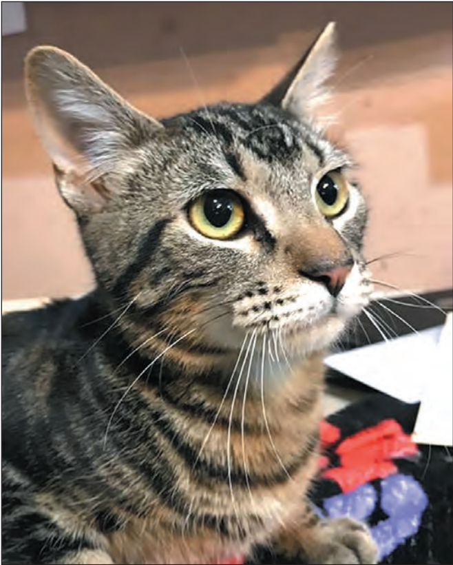
Meet Tom Keen, the Haven of the Ozarks Pet of the Week. Tom is a gorgeous two year old kitty who is looking for his forever home. He's part of a large group of cats rescued by a kind citizen in Shell Knob after they were dumped on her property. Tom and his feline buddies are now looking for families who will treat them as they deserve to be treated. All are beautiful and up to date on their vet work. Haven of the Ozarks is open 9 a.m. to 4 p.m. each day of the week or call (417) 835-3647 for more information. Haven of the Ozarks Animal Sanctuary is located at 9617 Farm Road 2190 in Washburn. Visit them online at www.havenoftheozarks.org .