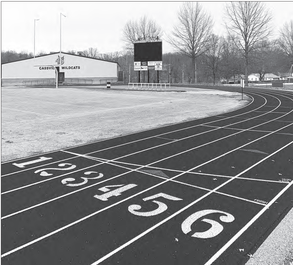
Here's the new resurfacing and relining at the Wildcat Stadium track.