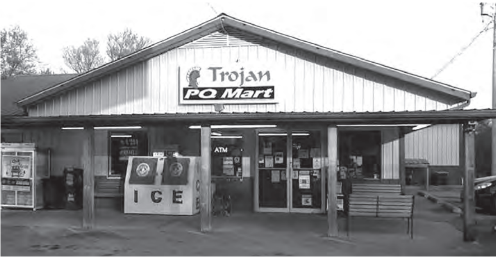
Trojan P.Q. Mart at 112 S Old Wire Rd. in Washburn serves lunch to students.

a few community members came together to make sure no student or kid went hungry during the cancellation of schools. “We have an awesome community. It’s small but we work hard together,” said Shockley. “We clean the the area inside every chance we get. We are fixing hot box meals, pizza and grill carry-out orders. We can deliver the food outside to you, as an option for your convenience.” Trojan P.Q. Mart is offering free lunches from their hotbox Monday through Friday, free of charge, for any students needing food while they are out of school. They are located 112 S. Old Wire Rd, in Washburn. They are open Monday through Friday 5 a.m. - 10 p.m.