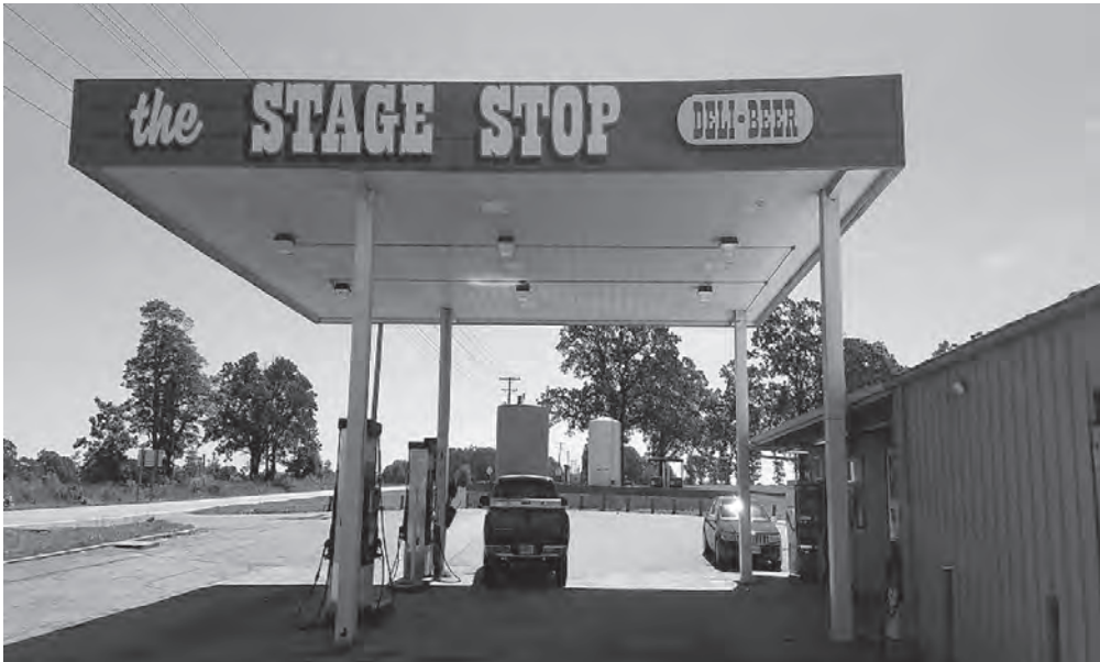
The Stage Stop at 9429 State Highway W in Butterfield serves breakfast and lunch to students.