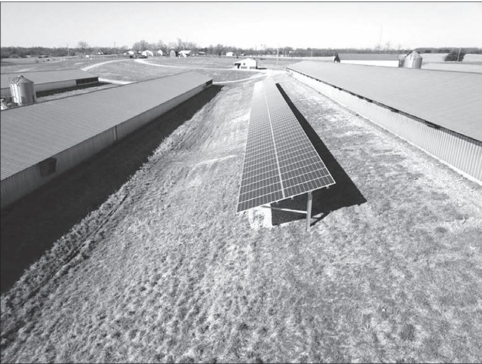
Chicken farms are usually ideal places for solar panels. Pictured above is a panel Roof Power Solar installed between chicken houses.

Roof Power Solar now serves businesses south of Kansas City all the way to Arkansas and as far east as Springfield, according to