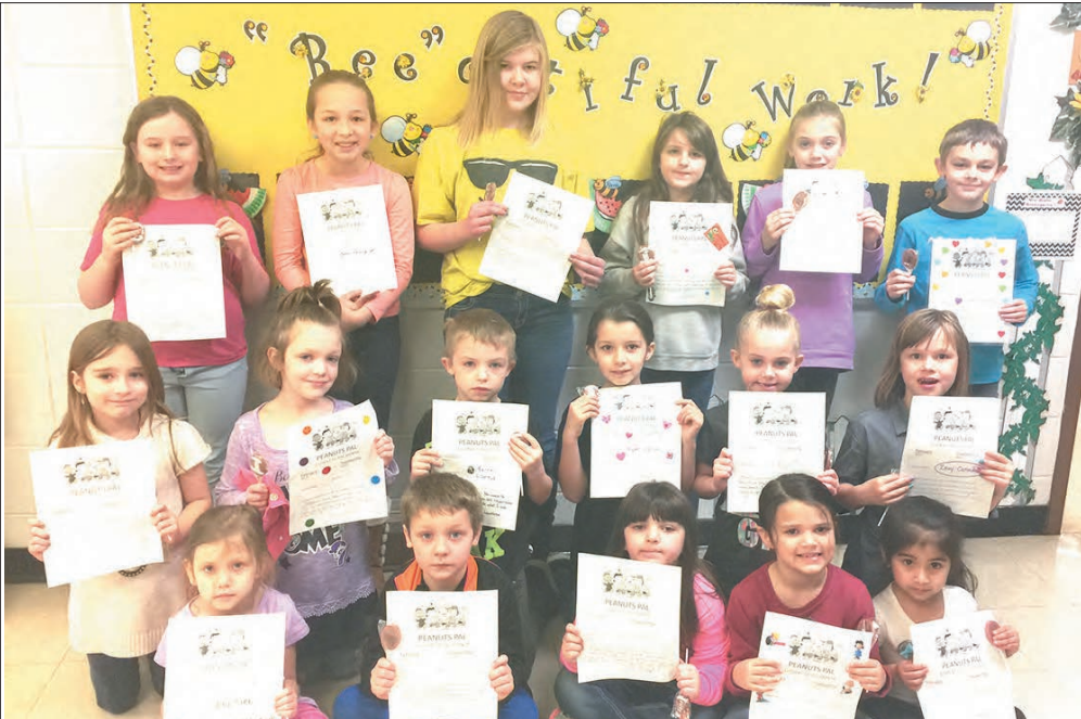
During the month of February, Southwest Elementary students were chosen to be "Peanuts Pal" Students of the Month. These students exhibited the character trait of trustworthiness.