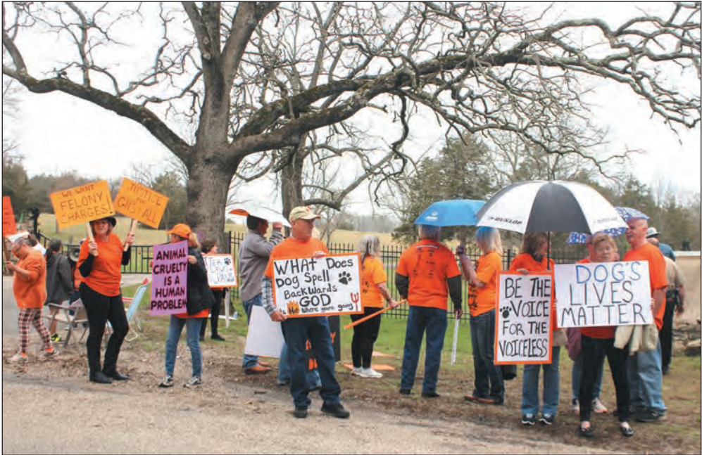
Dozens of protesters gathered on Saturday to demand Justice for Gus, a movement to gain attention to the shooting of three Labradors on Table Rock Lake.