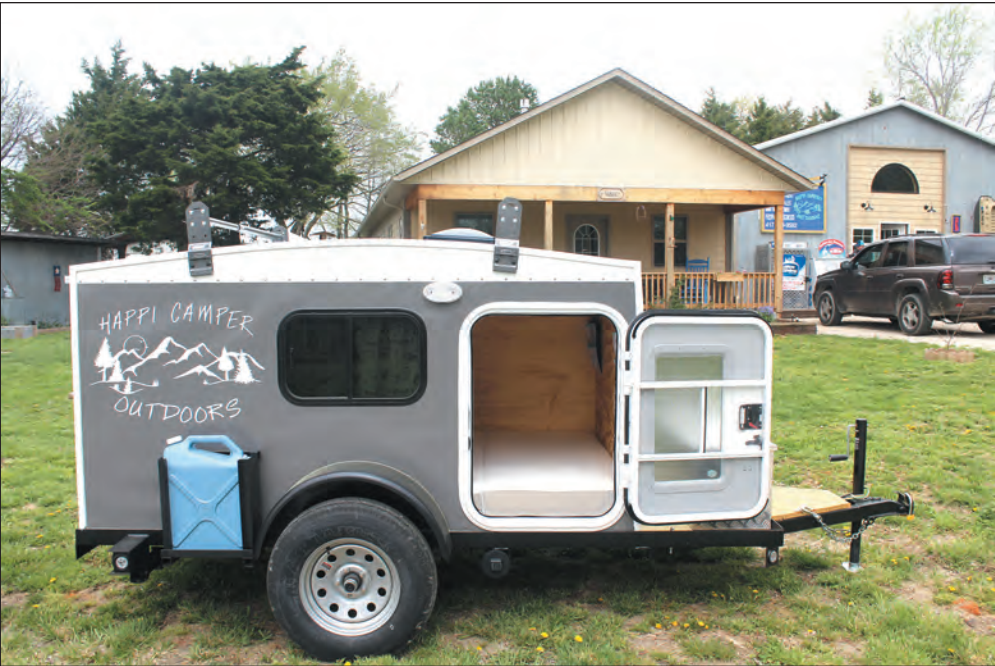
Happi Campers makes custom lightweight camping trailers that feature a sleeping area, storage and more in a tiny package. Trailers can be rented by the day or purchased outright and customized to the owners' needs.

Happi Camper Outdoors is open Wednesday through Sunday from 7 a.m. to 7 p.m. unless Monday falls on a holiday, in which case the shop is open. For more information, contact Happi Campers at (417) 489-9592. They can also be reached online at www.happicamperoutdoors.com and via email at happicamperoutdoors@gmail.com .