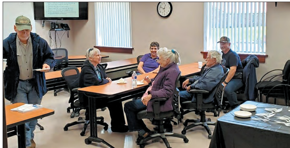
The Barry County E9-1-1 Center held an open house at the center on Friday, April 19, in honor of National Telecommunicators Week.