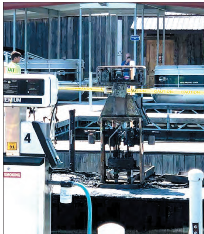
Pictured above is the fuel pump that was damaged as the result of the boat explosion at Kings River Marina.

The boat was towed from the scene by Tow Boat US in Shell Knob.