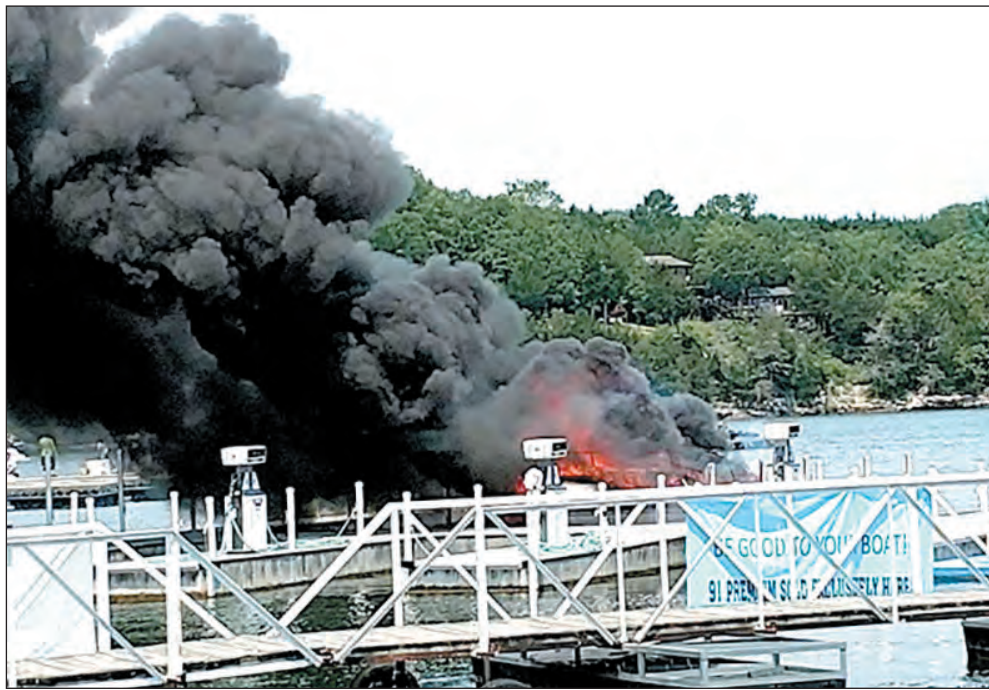
A boat explosion following fueling at the Kings River Marina left five people injured and a boat ablaze on Saturday, July 13.

The explosion happened at approximately 12:35 p.m. on Saturday, July 13. Central Crossing was dispatched to the scene at 1:15 p.m. where they immediately initiated patient care. Fire attack by land followed patient care, and the crew had the fire under control in about 15 minutes. Units were cleared from the scene by