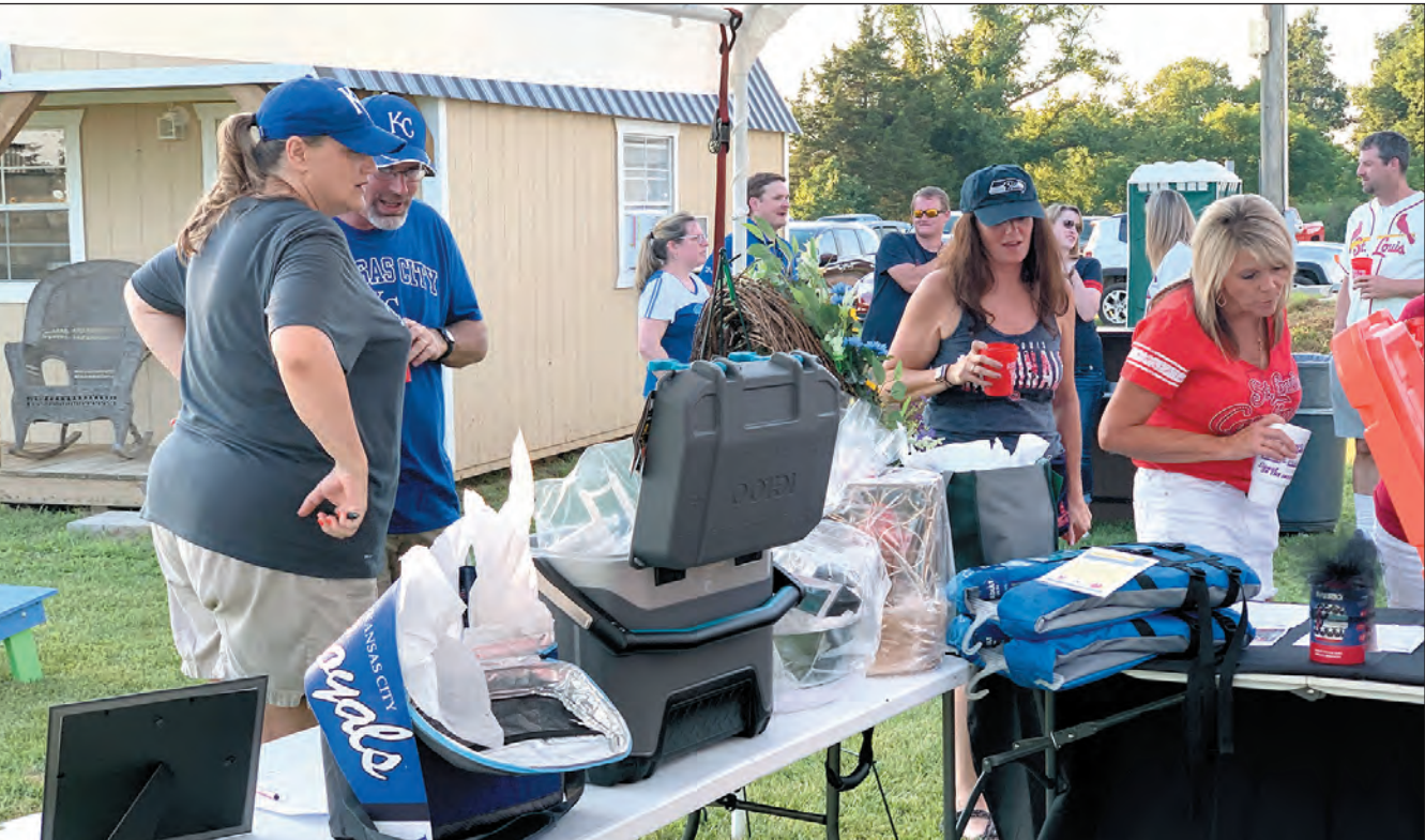
Dozens of people turned out for the Cassville Community Foundation Root for the Home Team fundraiser on Friday, July 12. The event featured the St. Louis Cardinals game on the big screen, baseball-type food and drinks, including brews by Hungry Hollow at Simplicity Lavender Farm in Washburn. The event boasted a silent auction, door prizes and more.