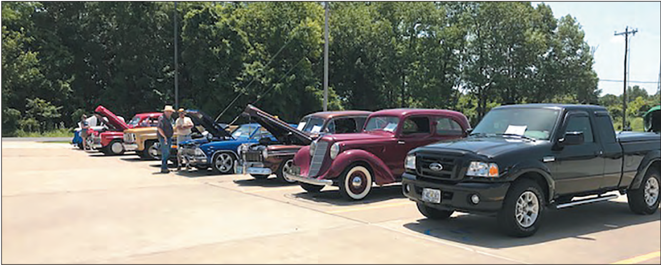
It was a beautiful day on June 27 for the 2nd annual Central Crossing Senior Center Car Show. Twenty-six vintage and newer vehicles were on display, from a 1930 Ford Model A to a 2012 Chevy Camaro Convertible. Around 100 people showed up to view and talk cars and enjoy a delicious lunch with friends both old and new.