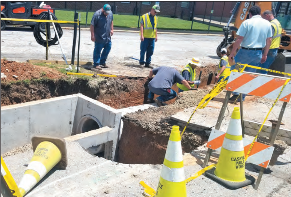
Cassville R-IV Schools, in conjunction with the City of Cassville and Seven Valleys Construction, finished the storm water project near the elementary school this week. Above, crew work to install new storm drain pipes to help alleviate flooding.

new system will take water run off from 14th Street and the surrounding areas and give it a drain to empty into. From there, the water will be transported underground, via concrete pipes, to a spot beside the field house on the backside of