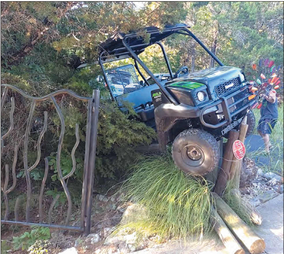
Pictured above is the UTV that crashed in Shell Knob on Thursday, seriously injuring the driver and requiring a lifeflight.

The Mule sustained moderate damage and was towed from the scene by a private party.