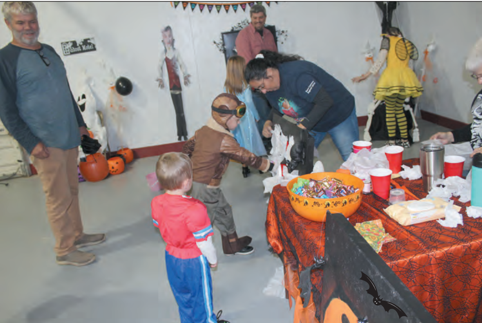
The ghosts and goblins were thick in Eagle Rock on Saturday afternoon, October 26, as they gathered for the annual Halloween party at Eagle Rock Community Association’s Howl-O-Ween Fest. From old favorites like the cake walk, to newer favorites like lazer tag and everything in between, the afternoon was enjoyed by over 100 children, many in costume. Prizes were given in several categories. This popular event is hosted by Eagle Rock Friends of the Library and made possible by dozens of local volunteers, making it truly a community project.

Coats will go to students of all ages. Ewbank also stated that the currently partnered businesses are open to participation from other organizations looking to get involved with the coat drive. To learn more about collection and drop-off points, or to get involved with the coat drive, contact the Cappy Harris Realtors office in Cassville at (417) 846-1144.