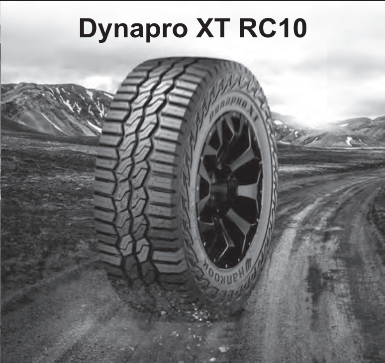
Dynapro XT RC10