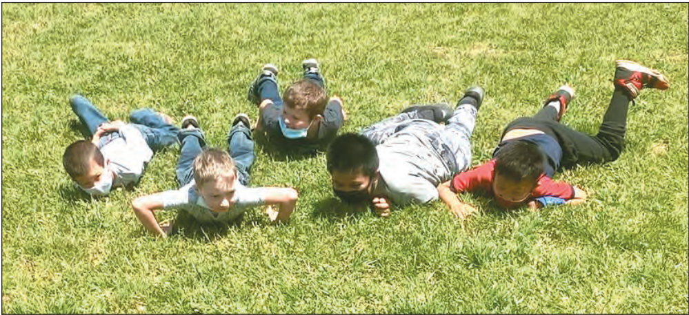
Above, First Graders participate in the worm race, as worms.

Ezra Devore As a finale to their Nature Week, a worm race was conducted by some of the grades K - 2 Cassville school children. Through the week leading up to the big race, the children enjoyed a fair amount of worm-related content: namely, the book "Diary of a Worm," a tale depicting the fictional life of a worm alongside his best friend Spider, and videos documenting the real-world behavior of worms. The children interacted scientifically and with nightcrawlers; conducting experiments to discover if they prefer light or dark environments, and forming hypotheses accord-