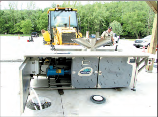
Above, the new Barracuda fish-cleaning station is put into place at the east end of Campground 3 in Roaring River State Park.