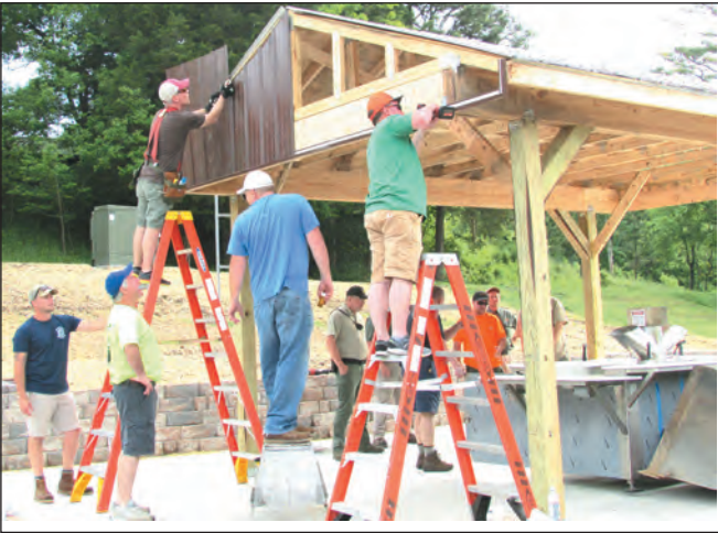
Above, volunteers from the Union Sportsmen's Alliance put the finishing touches on the shelter for the new Barracuda fish-cleaning (grinding) station at the east end of Campground 3 in Roaring River State Park.