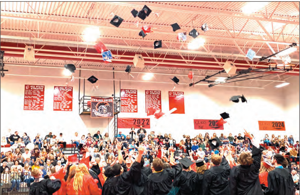
The graduating class celebrate their achievement with the classic throwing of their caps at Southwest High School in Washburn, Friday, May 21, 2021.