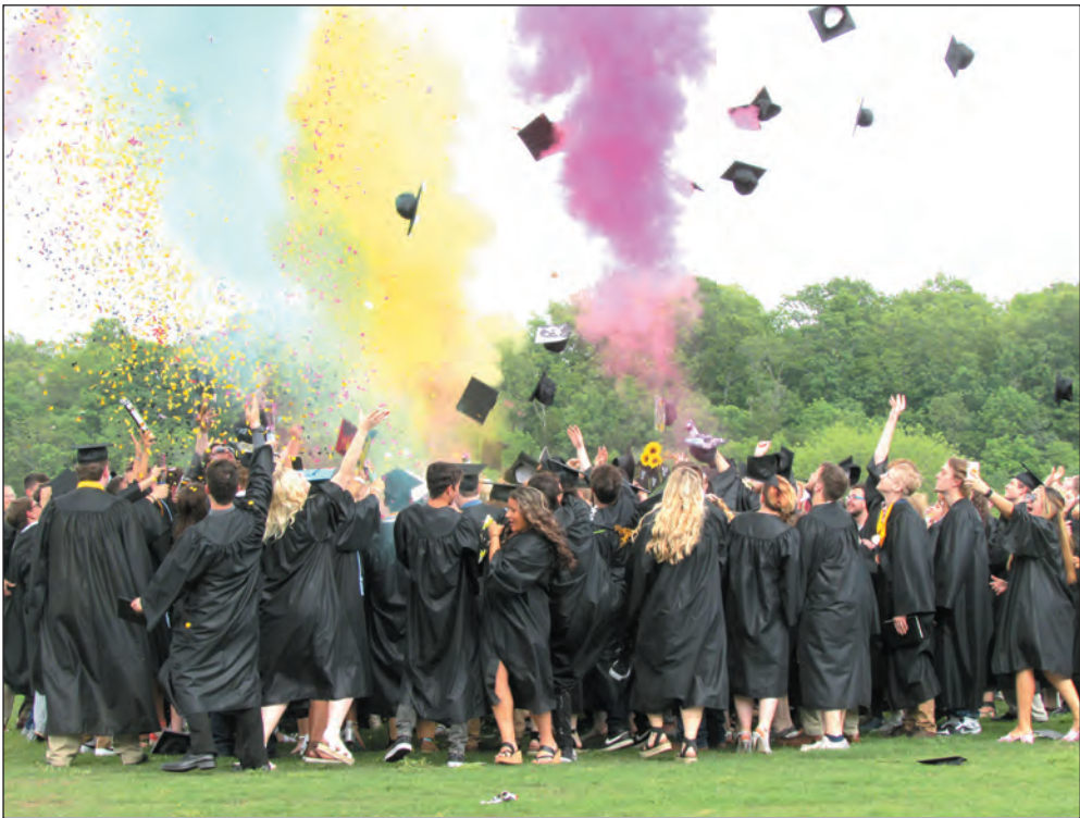
Cassville graduates toss caps to the wind in Wildcat Stadium, Sunday, May 23. See story on page 8A.