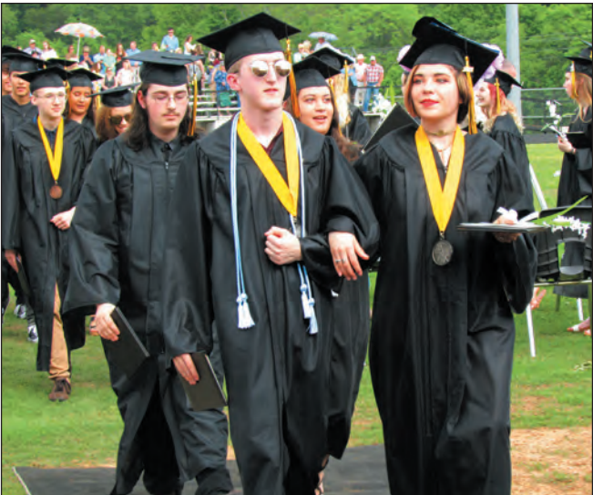
Above, now considered alumni, members of the CHS Class of 2021 recede from Wildcat Stadium with diplomas in hand.