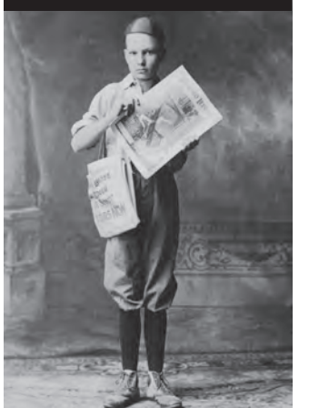
IN THE BARRY COUNTY ADVERTISER