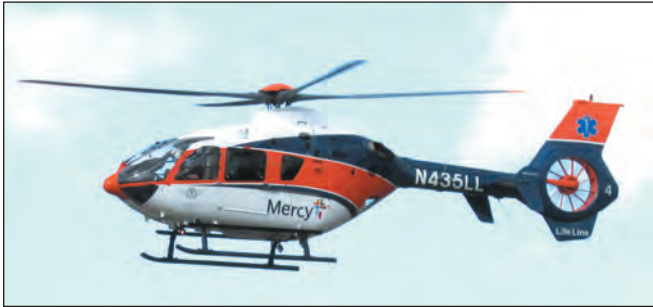
A Mercy Life Line helicopter lands in Cassville.