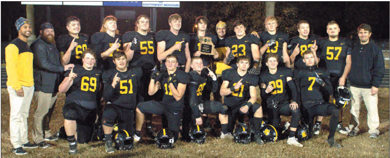
Jubilant Wildcats display the plaque commemorating their Friday night district playoff win.

Unless you are the Webb City Cardinals, district titles are a big deal. Much like Netflix at the Golden Globe awards, the Webb City machine wins, and wins, and wins. The Cardinals, 42-21 winners over Carthage on Friday night, have now collected 21 consecutive district