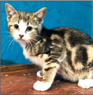
Meet Ash, the Haven of the Ozarks Pet of the Week! Beautiful Ash, her siblings,

and her mama are all at the Haven seeking forever homes. Their owners moved away and left mama Bootz to fend for herself. She wound up having babies, and the entire family was brought to us. The kittens are 14 weeks old, litterbox trained, used to being around both dogs and other cats, and will make great additions to their new families. Bootz isn't ready to leave quite yet, but she will soon be needing a new home, too. Visit the Haven to meet this sweet feline family and lots of other fantastic pets, too! Haven of the Ozarks Animal Sanctuary 9617 Farm Road 2190 Washburn www.havenoftheoark.org 417-835-3647 Open daily, 9 a.m. - 4 p.m. (excluding some holidays) Follow us on Facebook!