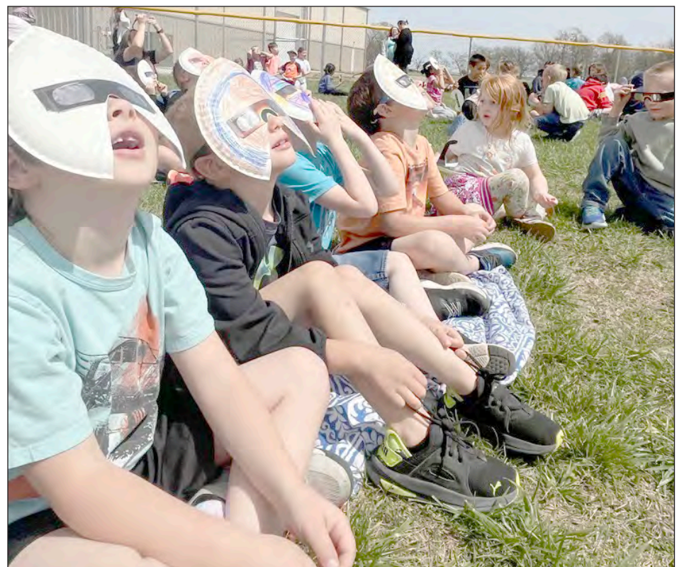
Wheaton Elementary students created masks for their solar eclipse glasses.

See more photos from the 2024 Solar Eclipse at www.4bcaonline.com