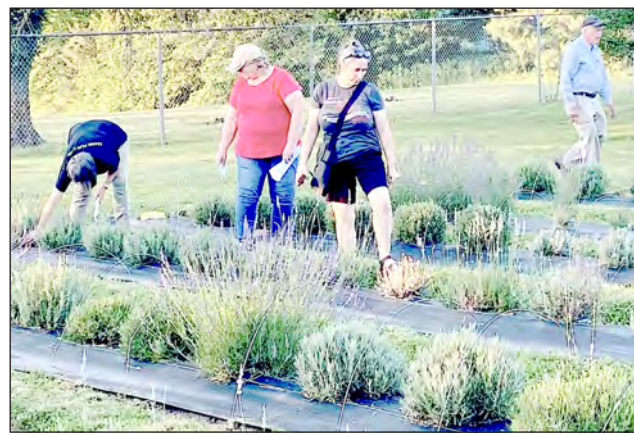
Missourians are showing increasing interest in growing lavender, which provides income opportunities for small-acreage farmers and those interested in value-added products.

Plants grow about 1-2 feet tall. Dense hairs coat the pale green leaves to give them their trademark silvery luster. The light purple lavender flowers are tiny and