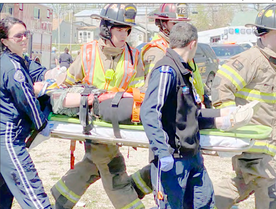
Area first responders assisted the Purdy FCCLA with a mock crash for Purdy HS students last week.