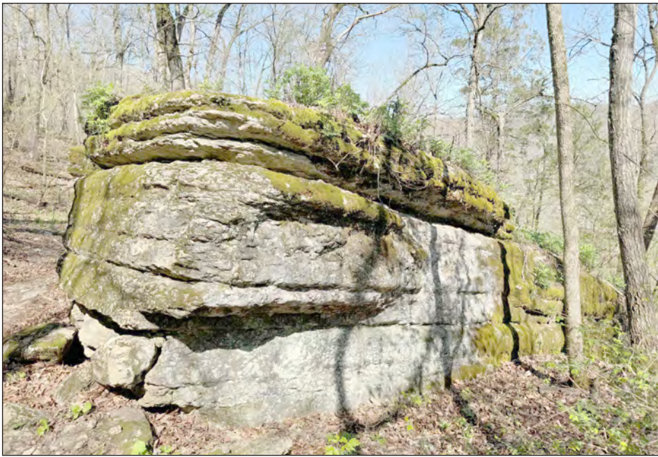
There are several bluffs and rock formations on Eagle's Nest Trail.