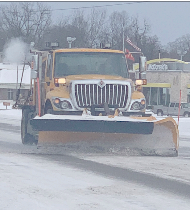
Missouri Department of Transportation crews worked day and night to get the roads cleared throughout Barry County after Sunday afternoon snowfall dropped up to 4 inches throughout the area.