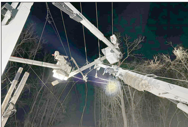
Barry Electric Cooperative lineman work to repair a broken three way pole on Saturday night near Oak Hill Cemetery.