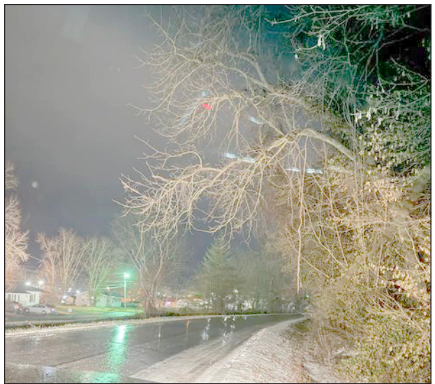
Area roads were covered with a thin sheet of ice throughout Barry County when storms producing freezing rain moved through the area Sunday night. Jacqueline Murray snapped the above photo around 5 a.m. Monday morning on Gravel Street in Cassville.

Freezing rain moved into southwest Missouri Sunday evening, lasting throughout the night and into Monday morning. With the below freezing temperatures, roads quickly iced over causing slide offs throughout the county. Central Crossing Fire Protection District closed Highway 39 northbound traffic from the Highway 76 intersection up to Cato for a few hours on Monday morning due to several slide offs. According to Central Crossing Firefighter Scott Robertshaw, no injuries were reported in the handful of slide-offs they encountered. The treacherous road conditions caused all area schools to either close or use AMI days on Monday, with only Southwest School remaining closed on Tuesday. Roads began to melt as temperatures climbed above freezing by Monday afternoon on the main roads.