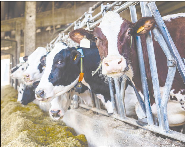
The 4th annual Missouri Dairy Expo will be held in Springfield in conjunction with Missouri Dairy's annual meeting on February 9.