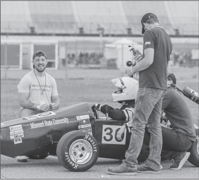
MSU engineering students completed the universities first formula-style car and competed at the Formula SAE Competition in May.

Each year, the Formula Society of Automotive Engineers (FSAE) challenges students to create small, formula-style cars and bring them to their competition to be tested, judged and raced. This year, teams took their creations to Brooklyn, Michigan, and competed at the Michigan International Speedway from May 16-20.