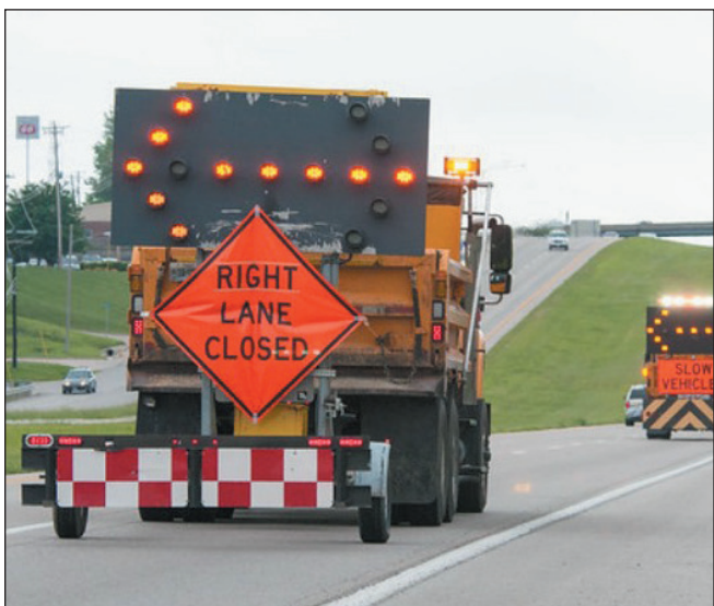
Contractor crews will begin sealing various routes throughout Southwest Missouri in the coming weeks.

Drivers should expect one lane traffic, flaggers and pilot cars where contractor crews are sealing various routes in