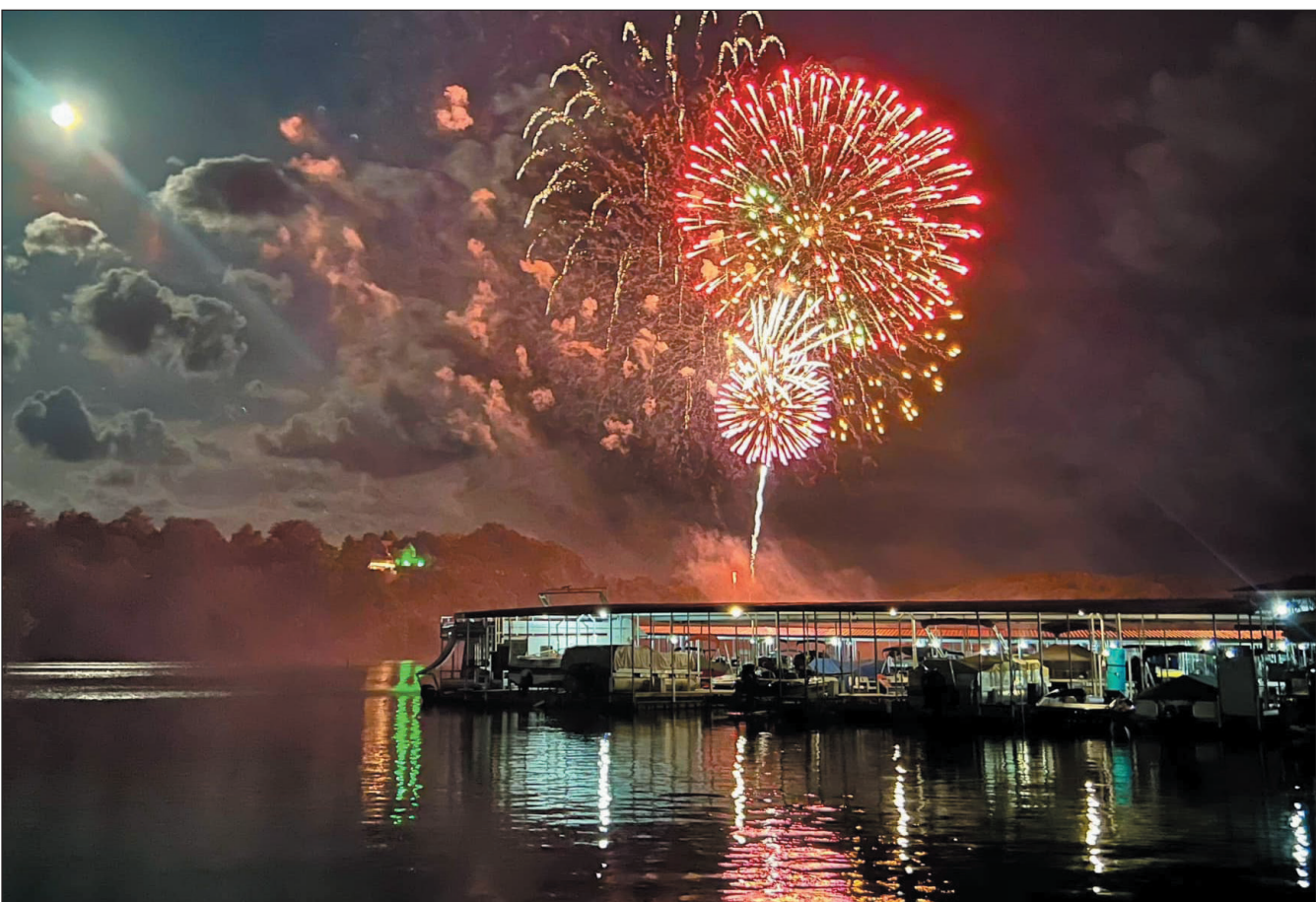
The Eagle Rock/Golden/Mano Fire Protection District hosted the annual Fired Up and Smokin' fireworks show last Saturday at the Table Rock Bridge on Hwy. 86 to eager spectators. The show is touted as one of the best in the area and is made possible through commercial and individual donations.