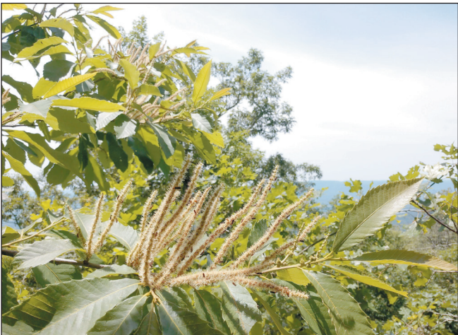
The Ozark Chinquapin tree and the birds and pollinators that visit them will be discussed at on Sunday at the Hobbs State Park-Conservation Area.