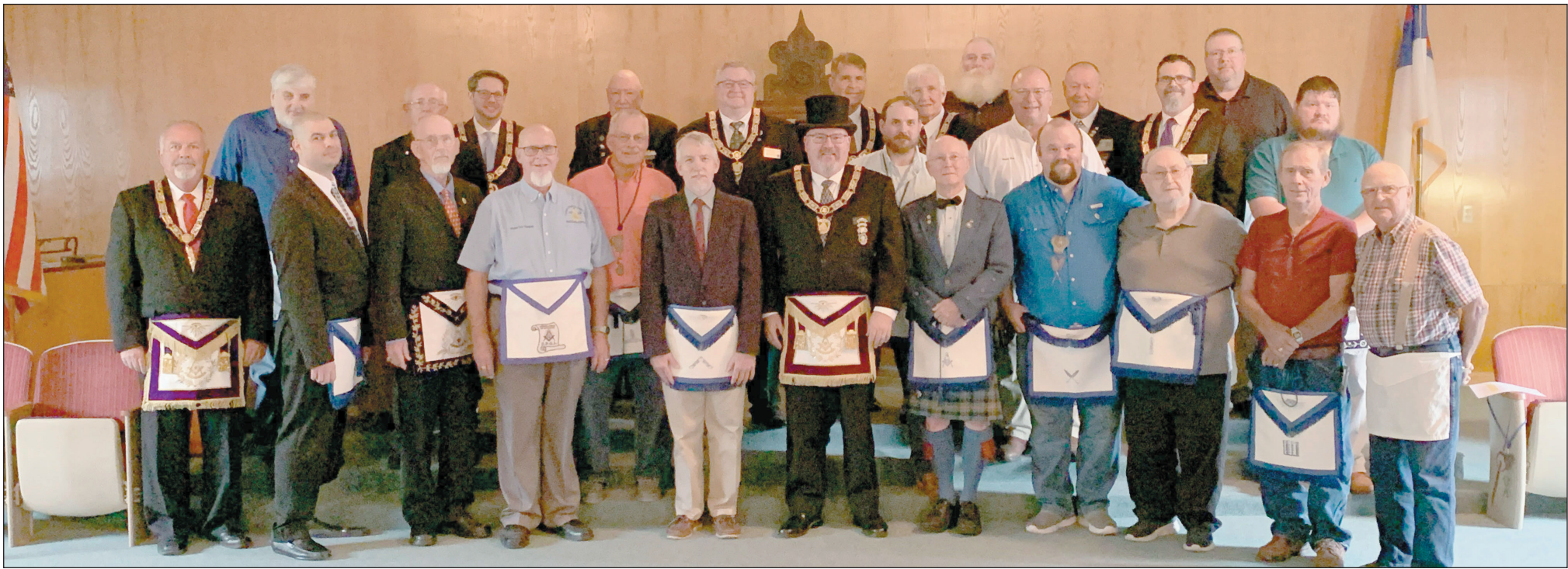
Member of Pythagoras Lodge 383 gathered last Saturday to celebrate the hall's 150th anniversary in Cassville.